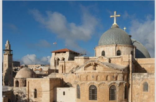
Church of the Holy Sepulcher