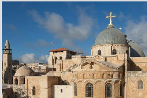
Church of the Holy Sepulcher

Experience the land where Jesus, Mary, and his disciples lived. See the places mentioned in the Bible. Leave forever changed. This unique opportunity fosters a deeper understanding of the land, culture, history, and religions of the region.